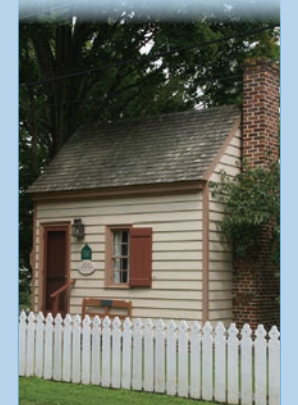
Oxford Custom House

Oyster tonger at work on traditional skiff.