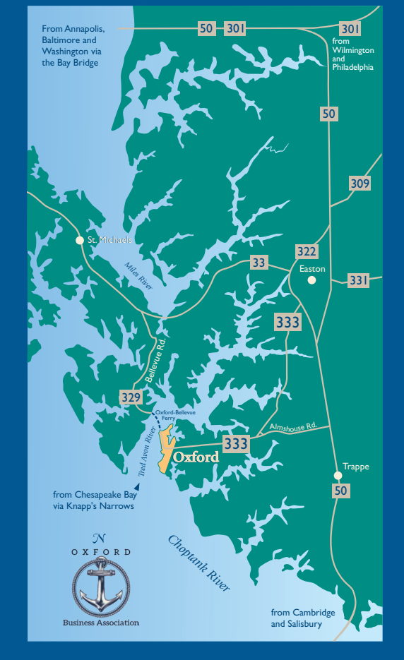
From Easton: Take Rt. 50 to Easton Parkway (Rt. 322), then Rt. 333 South 11 miles to Oxford